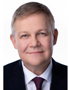
Thomson // File Photo: Scotiabank.