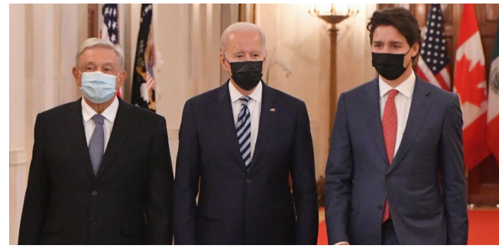
Mexican President Andrés Manuel Lopez Obrador, U.S. President Joe Biden and Canadian Prime Minister Justin Trudeau met last week in Washington.

U.S. President Joe Biden, Mexican President Andrés Manuel López Obrador and Canadian Prime Minister Justin Trudeau met Nov. 18 in Washington to discuss economic integration in North America. It marked the first time since 2016 that the three countries' leaders have met for the so-called Three Amigos Summit. What were the most important advancements that came out of the meeting, and what challenges remain? What is the status of one of the main economic sticking points among the countries—a proposed U.S. electric vehicle tax credit that is intended to favor unionized manufacturers that are based in the United States? How well are the three countries working together on migration?