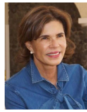
Chamorro // File Photo: @chamorro-