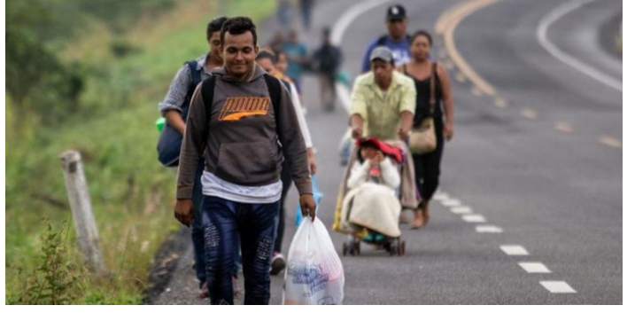
Countries in Latin America are bracing for higher levels of migration due to the Covid-19 pandemic. Migrants in Mexico are pictured above.

Chilean senators on June 8 reopened debate over legislation to increase restrictions on migration given concerns that the country could see an influx of migrants after the coronavirus pandemic eases. A report by the Department of Migration predicted that, without new restrictions, as many as 250,000 migrants could enter Chile annually as the country's economy is expected to have a quicker rebound than those of its neighbors. How likely are Chile and other countries in the region to see a sharp rise in immigration levels, and what factors will drive those flows? What pressures will an increase in migrants put on the receiving nations? What should countries in the region be doing now in order to prepare?