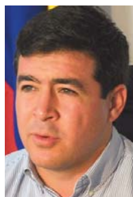
File Photo: City of San Cristóbal.