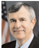
Johanns

US Agriculture Secretary Mike Johanns said Tuesday the United States would welcome a new offer on agriculture by the European Union in negotiations to reach a new global trade agreement, Reuters reported. "We welcome the opportunity to receive a new move on their part," Johanns was quoted as telling reporters. His comments came a day after the EU's top trade negotiator, Peter Mandelson, signaled the EU may make a new offer on agriculture, a key stumbling block in the trade talks. The EU has been criticized by the US, Brazil, and Australia for not making enough concessions on trade in farm goods ahead of a December 13-18 World Trade Organization ministerial meeting in Hong Kong. Mandelson said Monday the EU would not make a new proposal on agriculture before next month's ministerial, but noted that "if the momentum of the negotiation were to accelerate we would need to be in a position to engage further on agriculture as on other issues at some point—either at Hong Kong or after." Johanns yesterday called on the EU to match the US' offer on agriculture trade. However, the EU says the US offer does not address a large portion of domestic farm subsidies and lacks detail in other areas. The EU also says it wants developing countries, such as Brazil, to reduce barriers in areas where European companies are strong, such as industrial goods and service.