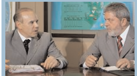
BNDES President Guido Mantega, left, met with Brazilian President Luiz Inacio "Lula" da Silva Wednesday while announcing a plan to lend 10 billion reais to the country's pulp and paper producers by 2010. See related story on page 3.