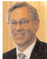
Rodriguez Photo: Andean Community