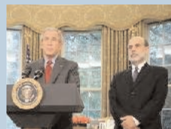
President Bush announced Bernanke's nomination at the White House yesterday.

Mexico's Grupo Financiero Bital . Last week, Mexico's Banking and Securities Commission said defaults on credit card loans were growing faster than performing loans, while nonpayment of consumer loans has increased for five straight quarters [Editor's note: look for a Q&A on Mexico's consumer lending market in next Monday's issue of the Latin America Advisor ].