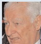
Azcona

Former President of Honduras Jose Azcona died Monday at his home from heart problems. He was 78.