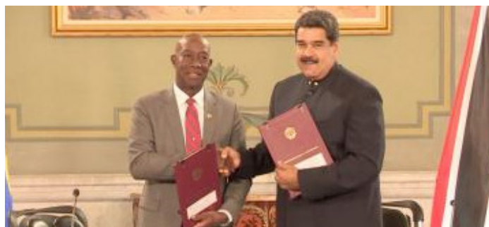
Trinidad and Tobago Prime Minister Keith Rowley and Venezuelan President Nicolás Maduro (L-R) signed their new energy deal on Aug. 25.

Q Trinidad and Tobago and Venezuela signed a deal on Aug. 25 that allows the island nation to process natural gas from the offshore Dragon field in Venezuela, with the aim of boosting the countries' gas outputs and export revenues. The project will supply 150 million cubic feet (MMcf) per day in its first year, 2020, which will be used for the liquefied natural gas (LNG) and petrochemical sectors in Trinidad. Will the two countries follow through on the deal? How will Trinidad benefit from the agreement, and how likely is it to help cash-strapped Venezuela increase its gas production and exports?