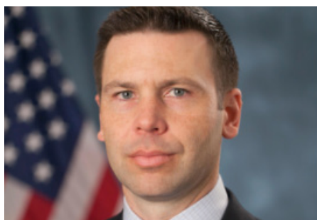
McAleenan

U.S. President Donald Trump’s executive order to stop the separation of migrant families after a national outcry has brought changes to the zero-tolerance immigration policy enacted at the U.S.-Mexico border, the Associated Press reported. Customs and Border Protection Commissioner Kevin McAleenan said on June