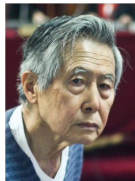
Fujimori // File Photo: TV Perú.